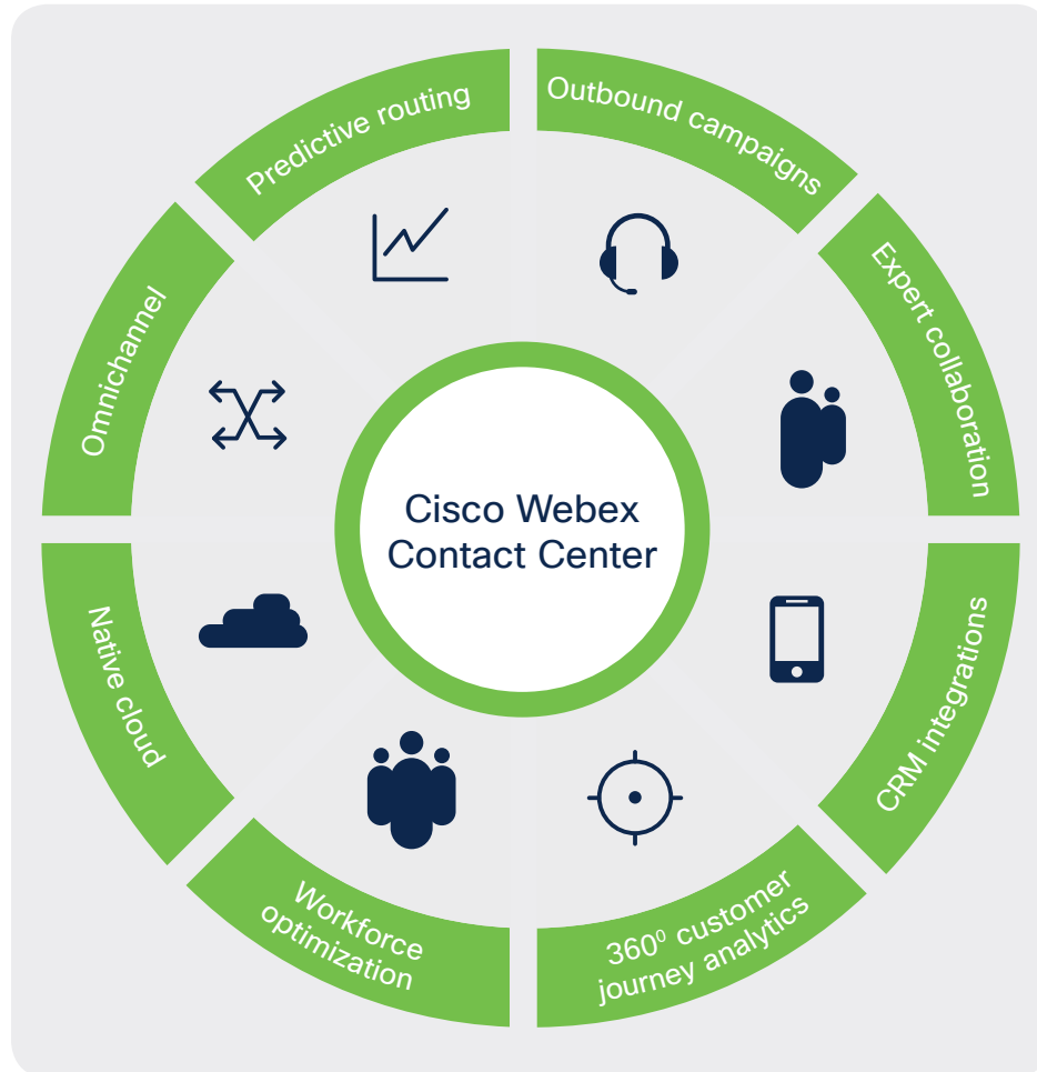
Figure 1. An innovative set of capabilities for the cloud-based contact center of today and tomorrow

• Outbound campaigns. An outbound campaign manager automates outbound calls for sales and marketing campaigns. Preview and progressive dialing help assure agent productivity. Easy administration, a compliance tool, flexible and intelligent list management, and sophisticated dial management rules—including campaign chaining—put you in control.